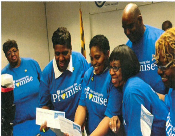
(CUB members committing to “Reclaim the Promise”)